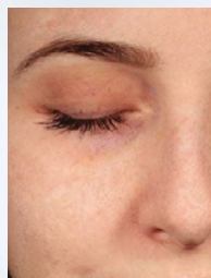
AFTER 12 WEEKS*