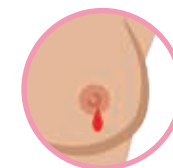
Clear or bloody fluid that leaks out of the nipple