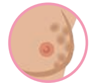
Change in skin color or texture