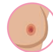
Nipple pain or change in how the nipple looks